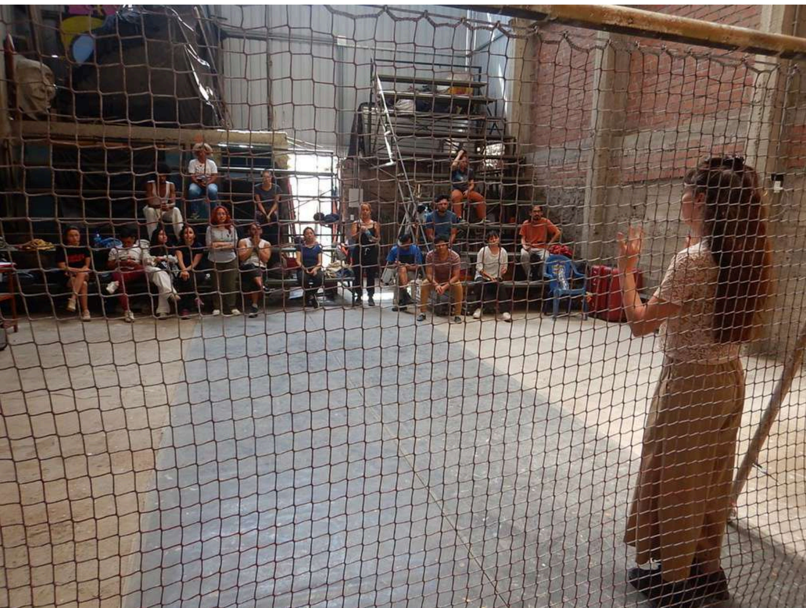
Here I am giving the 'LIMIT' workshop in Lima, Peru, through Aecid. 2025